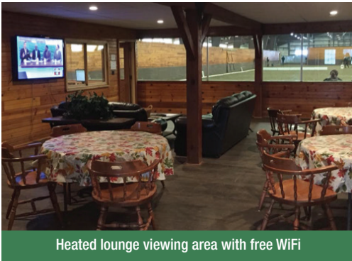
Heated lounge viewing area with free WiFi

Chagrin Valley Farms is Northeast Ohio's leading equestrian center conveniently located near the lovely village of Chagrin Falls and 30 minutes from downtown Cleveland sports, theater, museums and numerous shopping centers and dining options. Under new ownership, the farm has undergone major renovations indoors and outdoors.