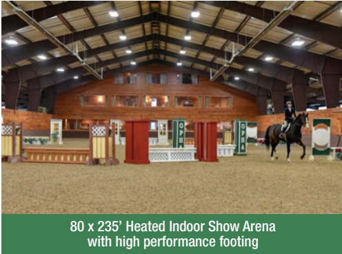
80 x 235' Heated Indoor Show Arena with high performance footing