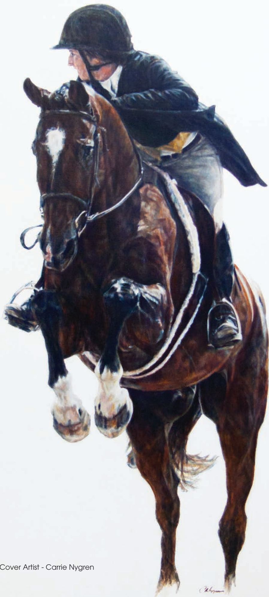
Cover Artist - Carrie Nygren