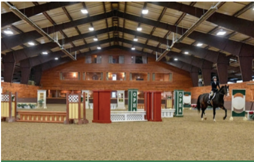
80 x 235' Heated Indoor Show Arena with high performance footing