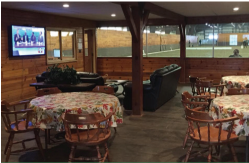
Heated lounge viewing area with free WiFi

Chagrin Valley Farms is Northeast Ohio's leading equestrian center conveniently located near the lovely village of Chagrin Falls and 30 minutes from downtown Cleveland sports, theater, museums and numerous shopping centers and dining options. Under new ownership, the farm has undergone major renovations indoors and outdoors.